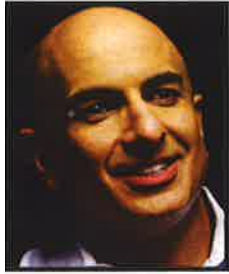
NEEL KASHKARI for Governor