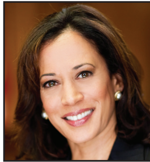
KAMALA HARRIS for United States Senator